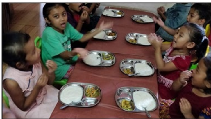
Eating time "Kheer"