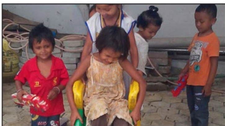
Playing with friends