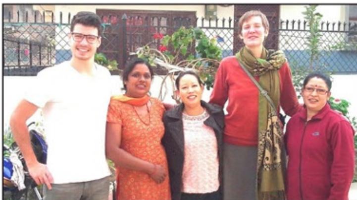
Happy time with our Volunteers from Abroad.