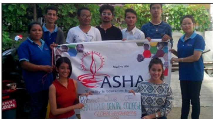
Global Hand Washing Day - Retracted Club of Kantipur Dental College