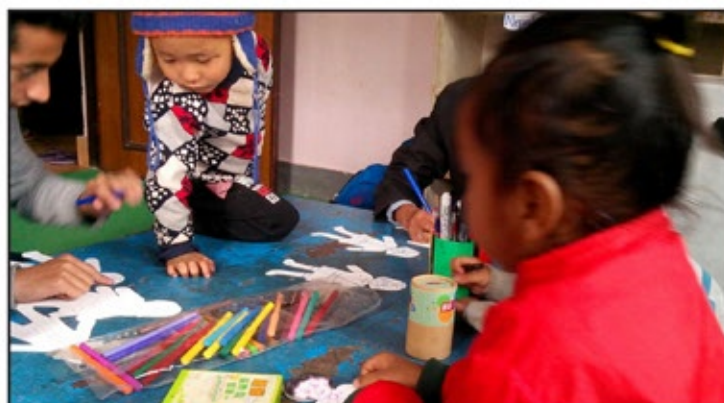
Art and Craft Classes.