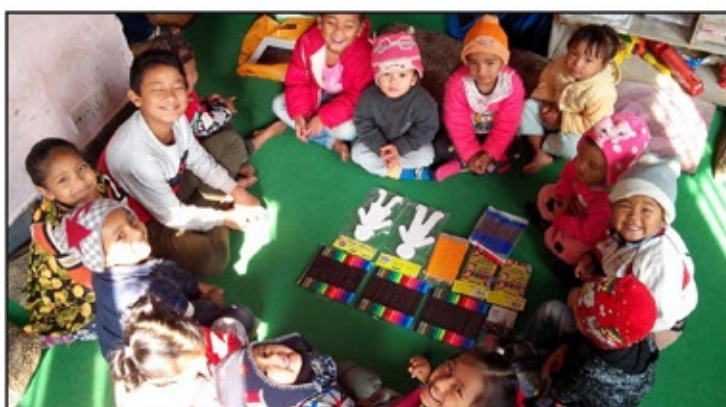
Happy to get Stationaries