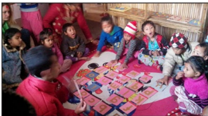
Practical exercises in Montessori Class