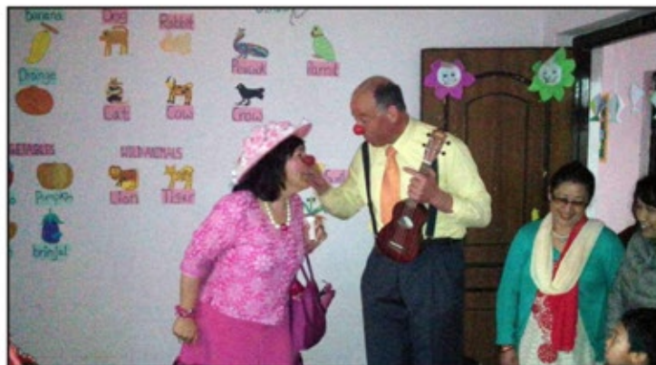
Enjoying "Clown" play with our volunteer from Abroad.